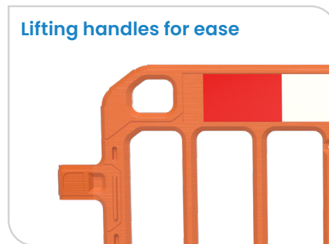
Lifting handles for ease